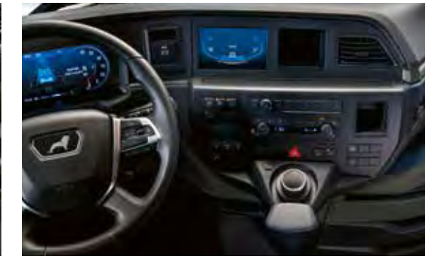
Infotainment system with 7-inch display and MAN SmartSelect