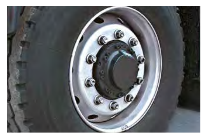
Front axle with hydrostatic wheel hub motors

Of course, anyone who makes it up the mountain wants to come back down again, too. That's where the MAN Brake-Matic smart brake with electric braking and ABS comes into play. They make it possible, for example, to maintain a constant speed when going downhill by regulating the sustained-action brakes automatically. In situations where you have to react fast, the MAN braking system is exactly the partner you want at your side, too: based on the strength of pedal movement, the braking assistant recognises when hazard braking is needed and immediately activates full braking power. No matter where the road takes you, the MAN TGS gives you the power and security you need.