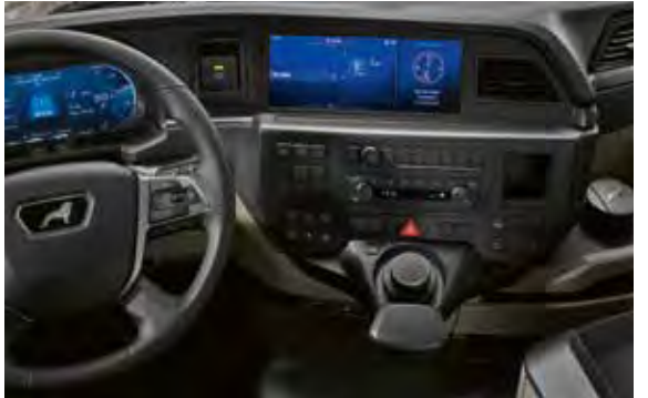
Infotainment system with 12-inch display and MAN SmartSelect

The infotainment system can be operated either via a classic control system with buttons or via MAN SmartSelect (can be combined from version Advanced 7-inch). Throughout, familiar usage meets innovative comfort. The result is one you can see and feel, too, as high-quality surfaces make every journey with the MAN TGS tangibly special.