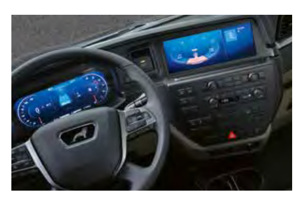
Infotainment system with 12-inch display and control system below the secondary display