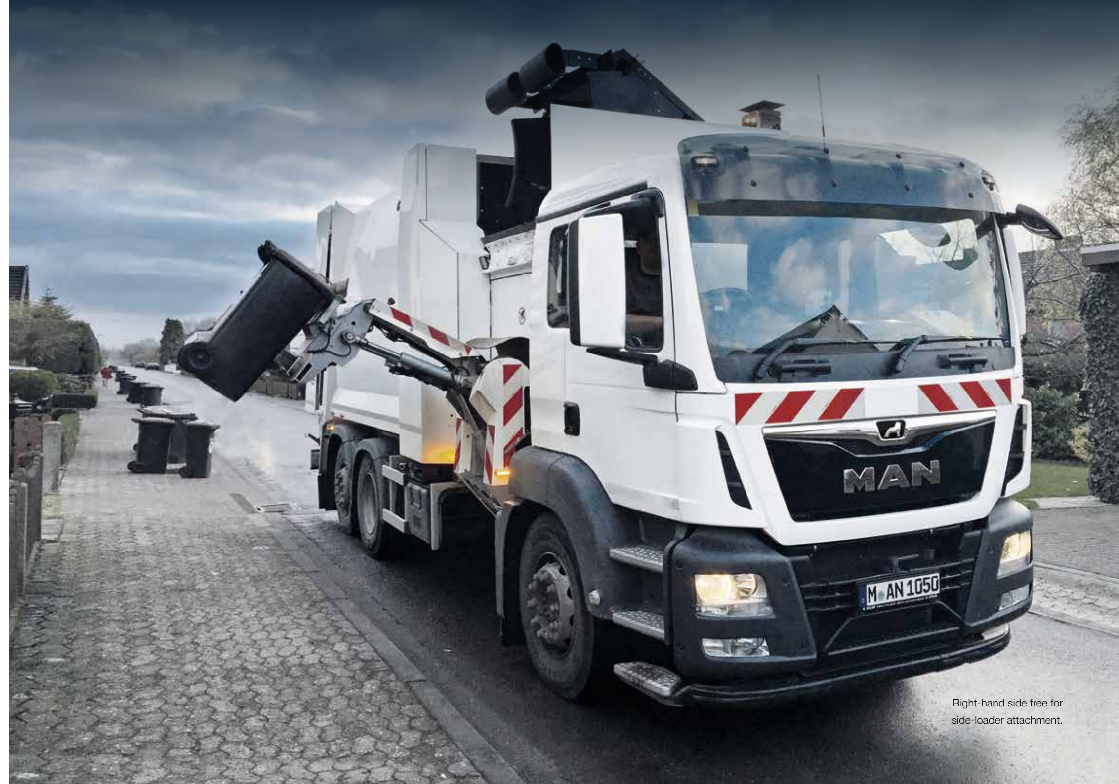
Right-hand side free for side-loader attachment.

DIN requirements for refuse collection and are optimally prepared for the seamless assembly of all refuse-collector bodies, whether they are front, rear or side loaders, fixed or swap-body systems. To ensure that just one vehicle can be used to transport cargo and crew, the TGS is fitted with a four-seater bench at the factory – disposing of one more disposal concern.