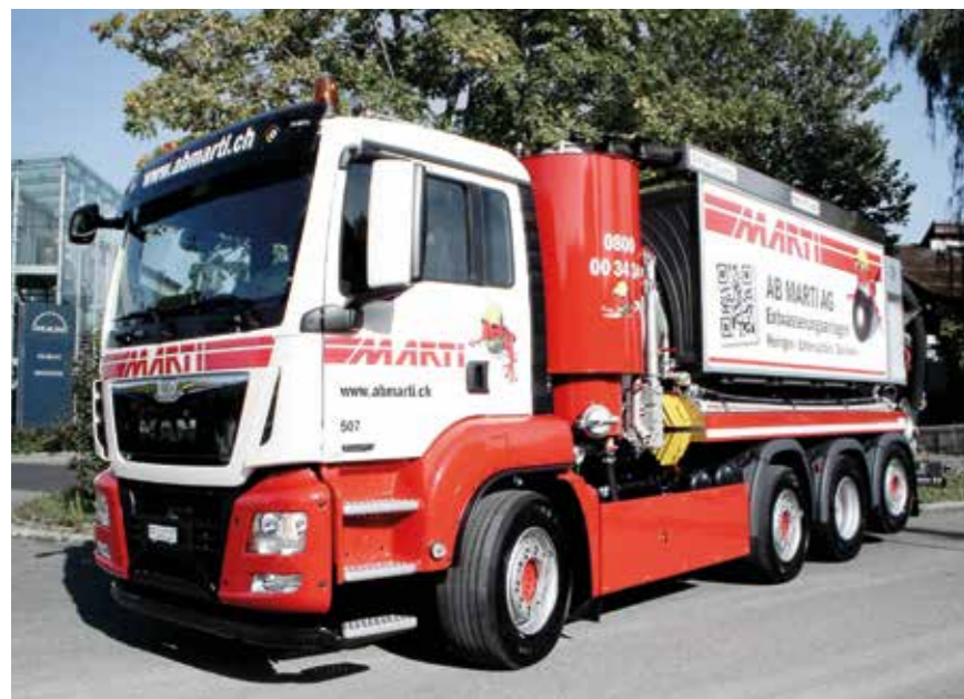
Retrofit leading axle