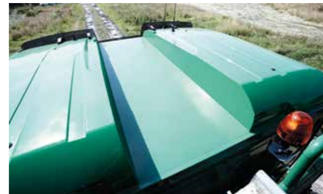
Central roof recess