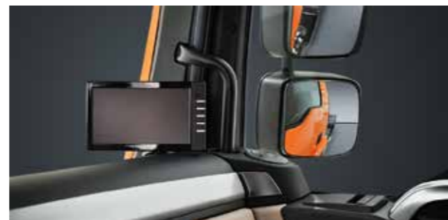
VTA (video turning assistant)