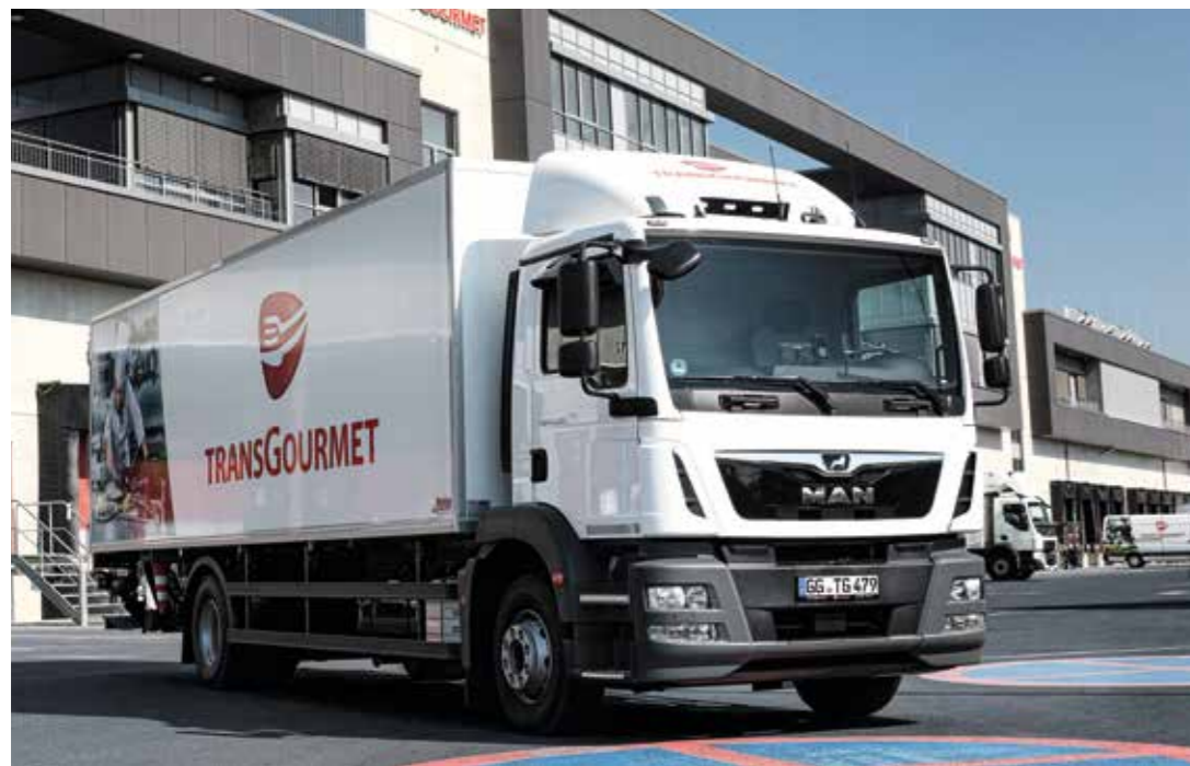
Conversion of 120KD power take-off from flange connection to pump connection