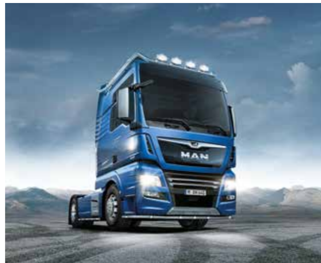
Vehicle lighting, e.g. auxiliary headlights or LEDs*