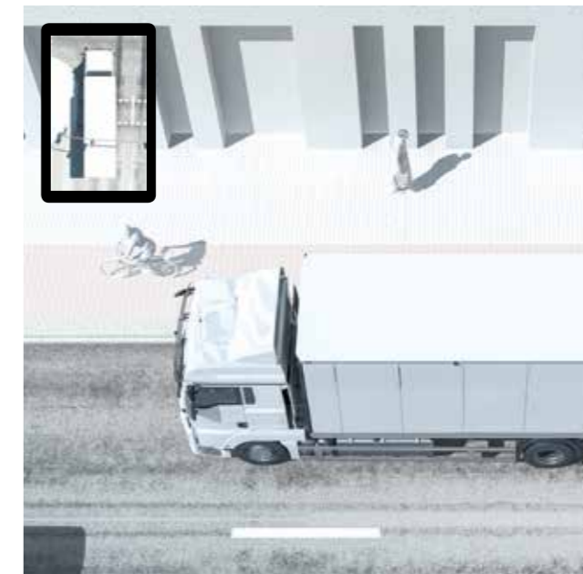
MAN BirdView: The 360° HD camera system