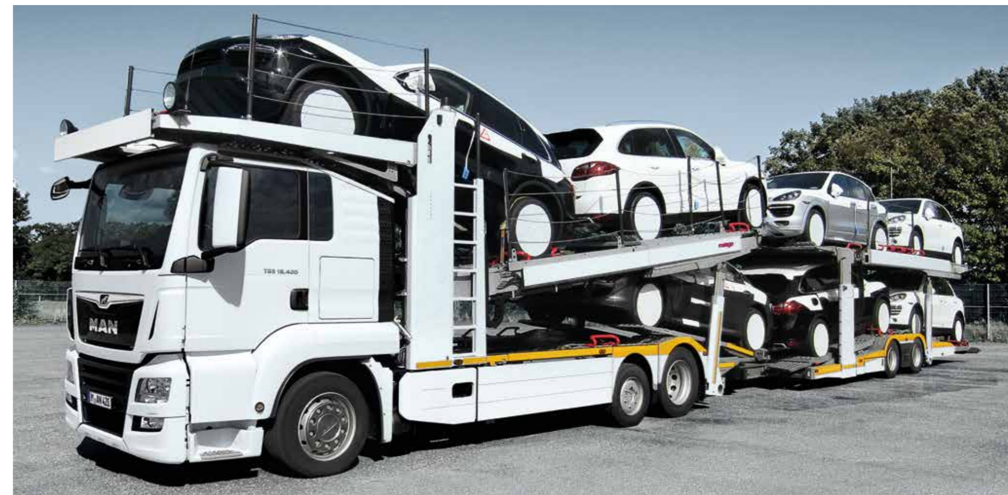
Optimising the vehicle height with flat roof at a 16° angle with an option to adjust the cab mount and fit a leading axle