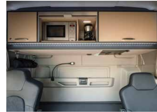
Perfect for the self-sufficient: an on-board kitchen