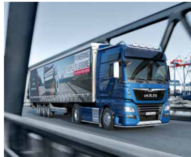
Customisation with stainless steel components.