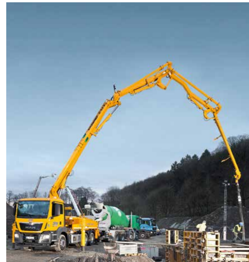
Adjustment to frame trim for concrete pump superstructure