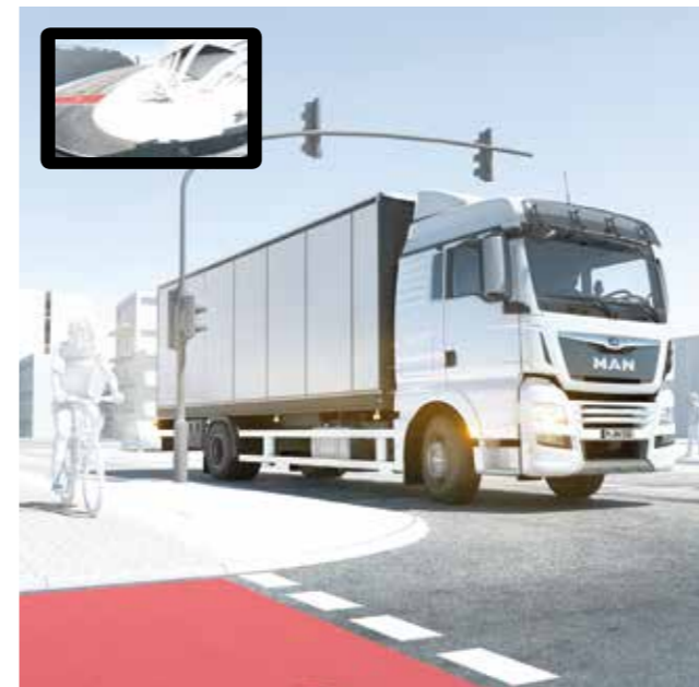
MAN Video Turning System