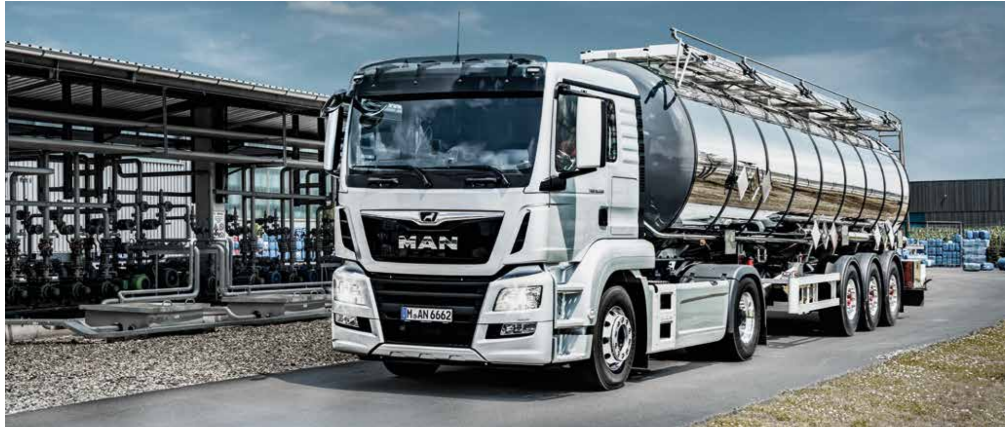
Weight optimisation for tank cradle