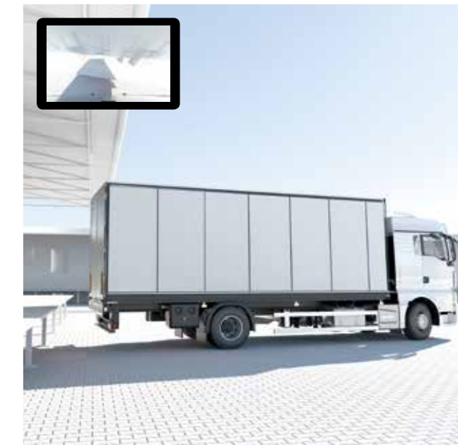
MAN Rear-view Camera System