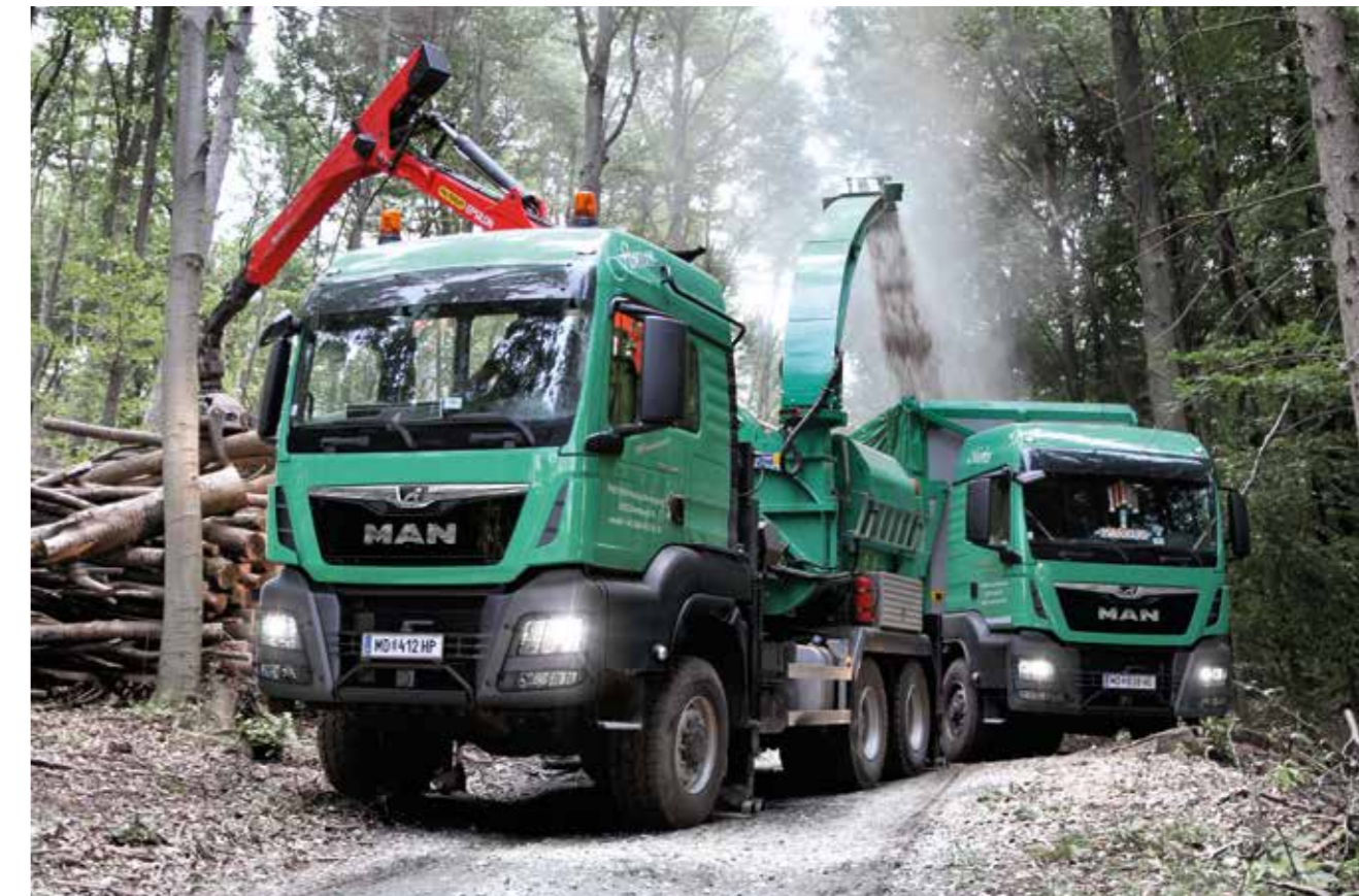
Wood chipper in use