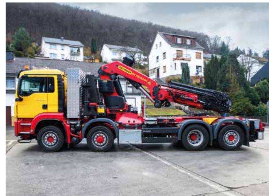
Retrofitted leading axle