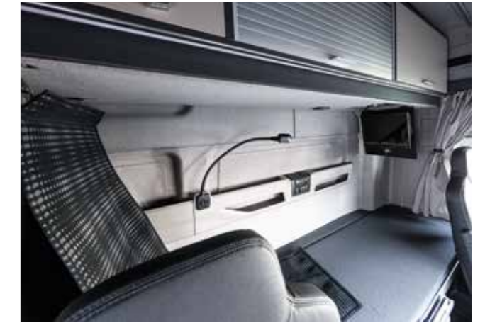
A rested driver drives better: a hammock for relaxing