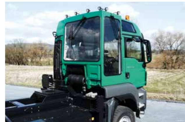
Cab glazing for stationary machinery