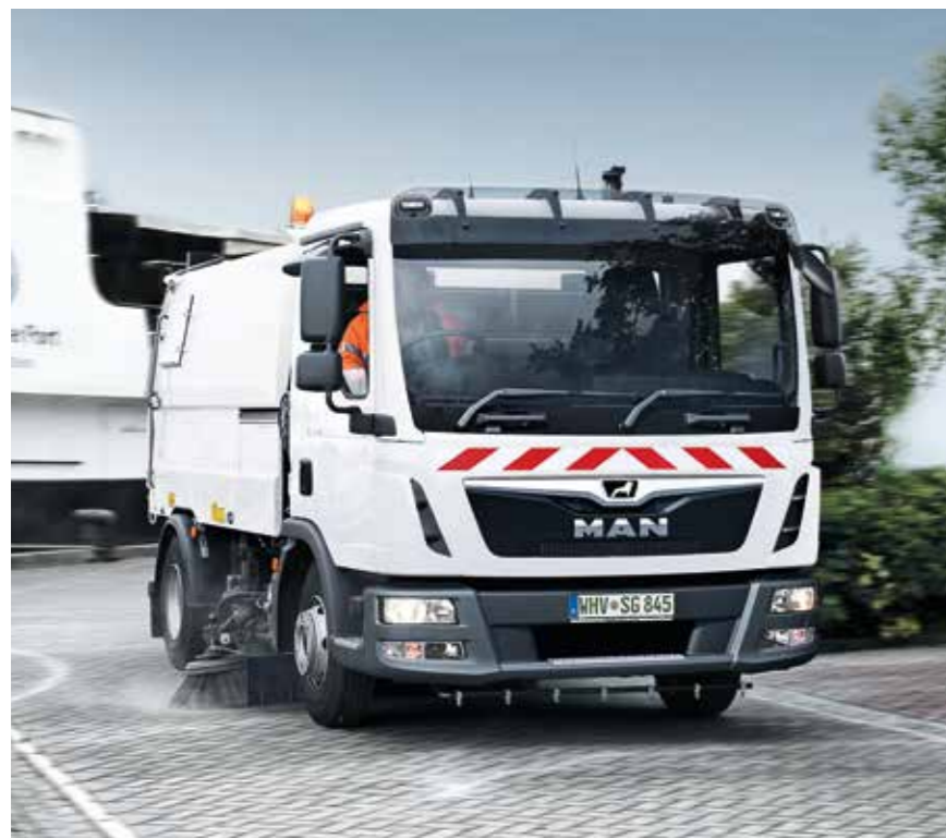
Adjustment to frame trim for sweeper structure