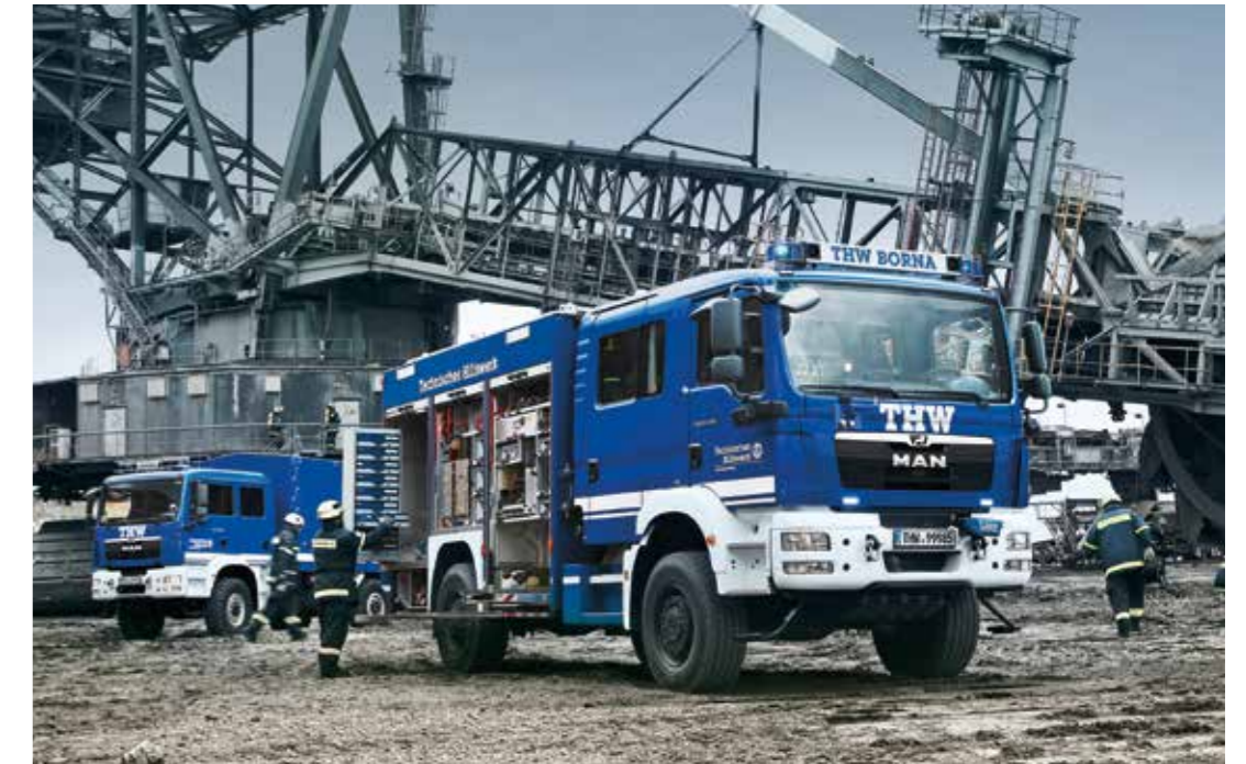
Glass-fibre-reinforced plastic crew cabin (crew of 1+8), signal technology and emergency service radio equipment