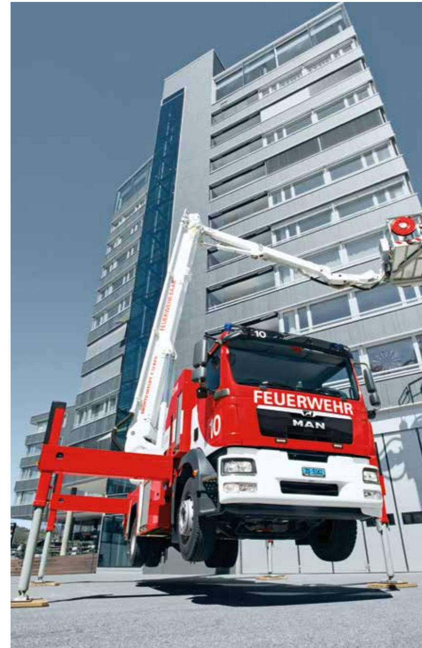
Frame trim, roof modification and wheelbase modification for skylifters