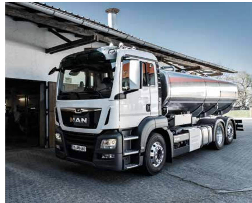
Milk collection vehicle. Left side of frame with offset exhaust muffler; right side of frame kept free ex works to reserve space for the superstructure's attachments (roller shutter, see right)