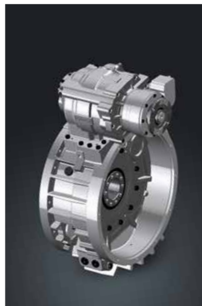
OMSI PTO for vacuum trucks