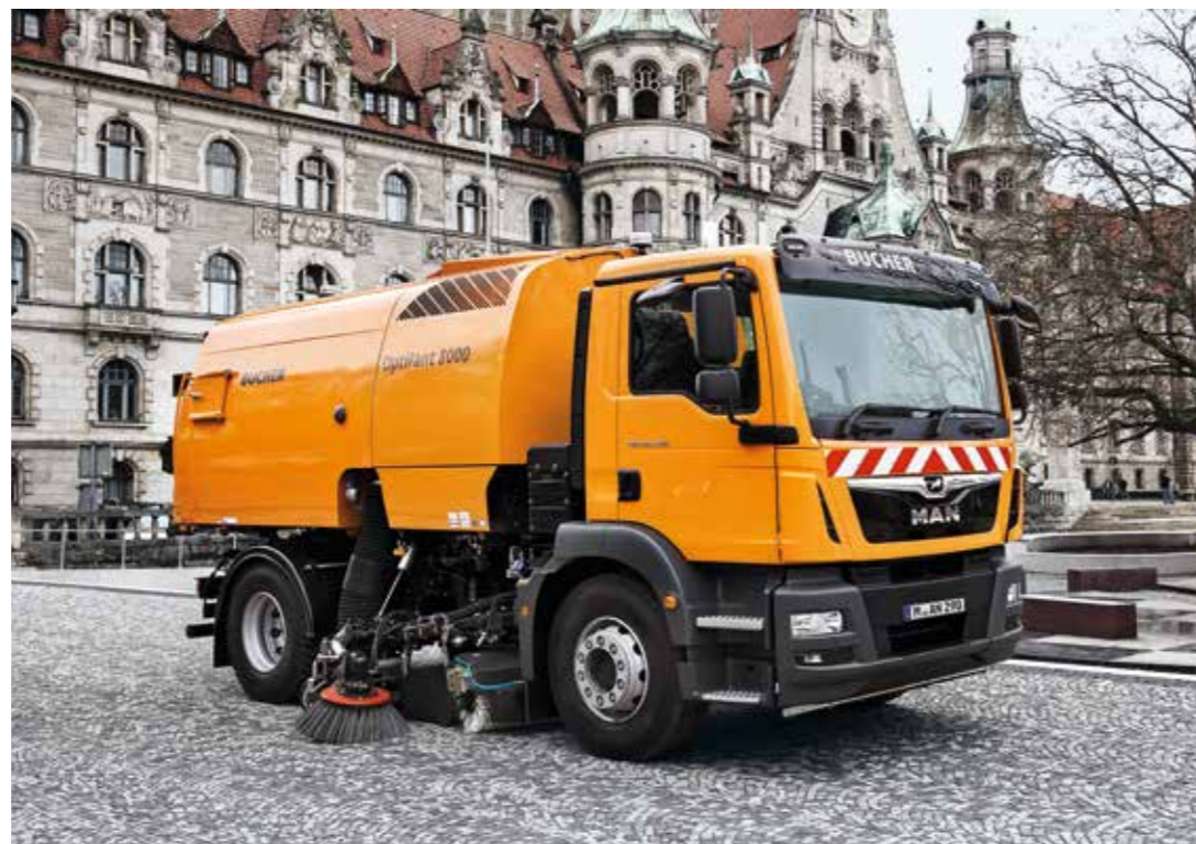
Adjustment to frame trim for sweeper structure