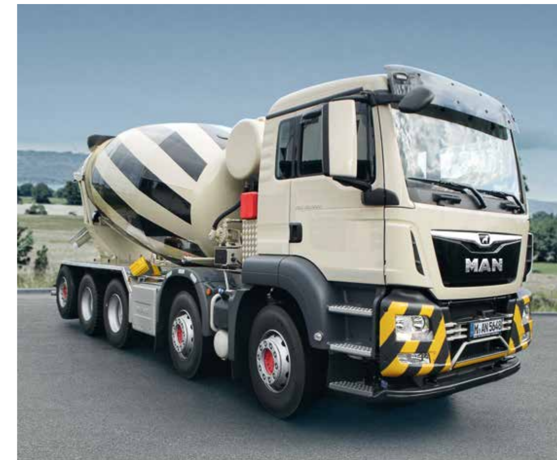
Trailing axle fitted (five-axle vehicle ex works)