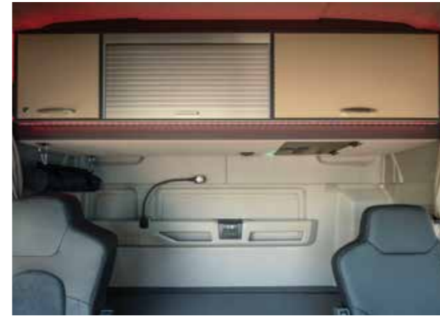
Storage can be this good: exterior LED lighting on the storage cabinet with various colour programmes

Feel-good entertainment: the brilliant LED display is the ideal platform for every entertainment programme.