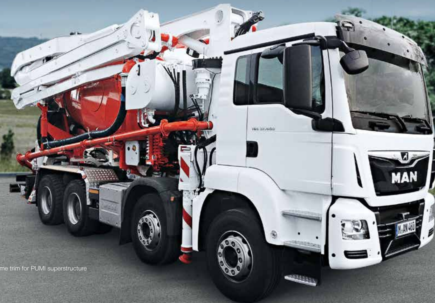
Adjustment to frame trim for PUMI superstructure