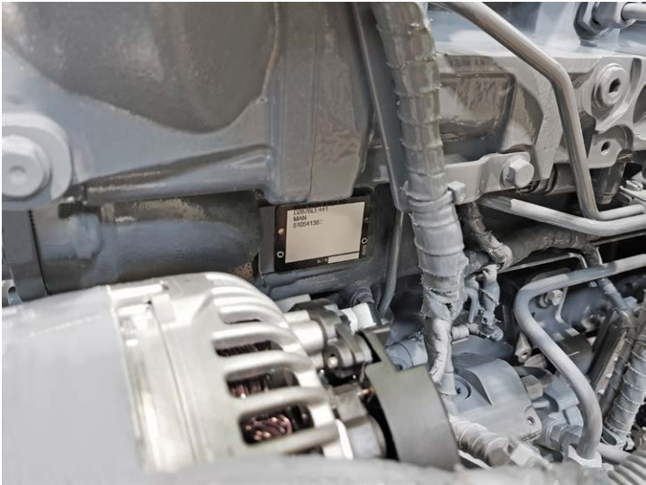
Type plate MAN D2676 (second possibility)