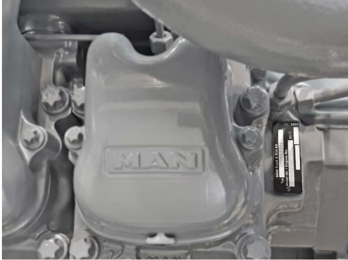
Type plate MAN D2842