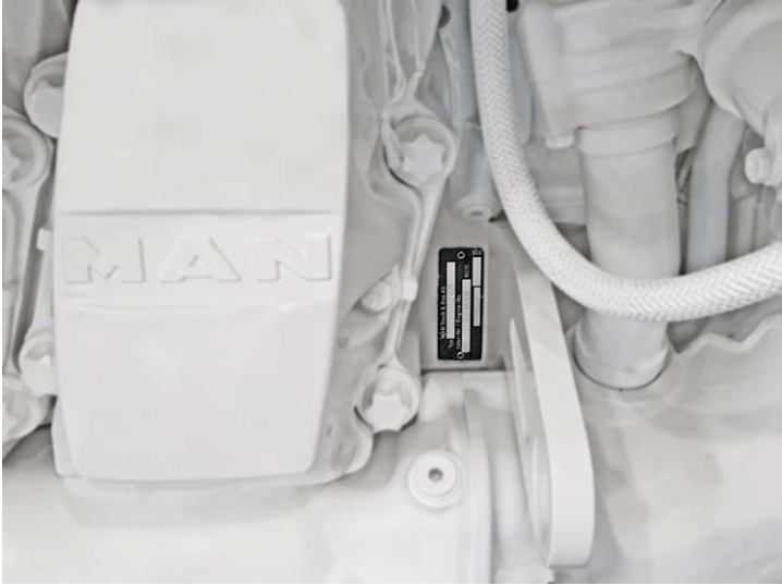
Type plate MAN D2862