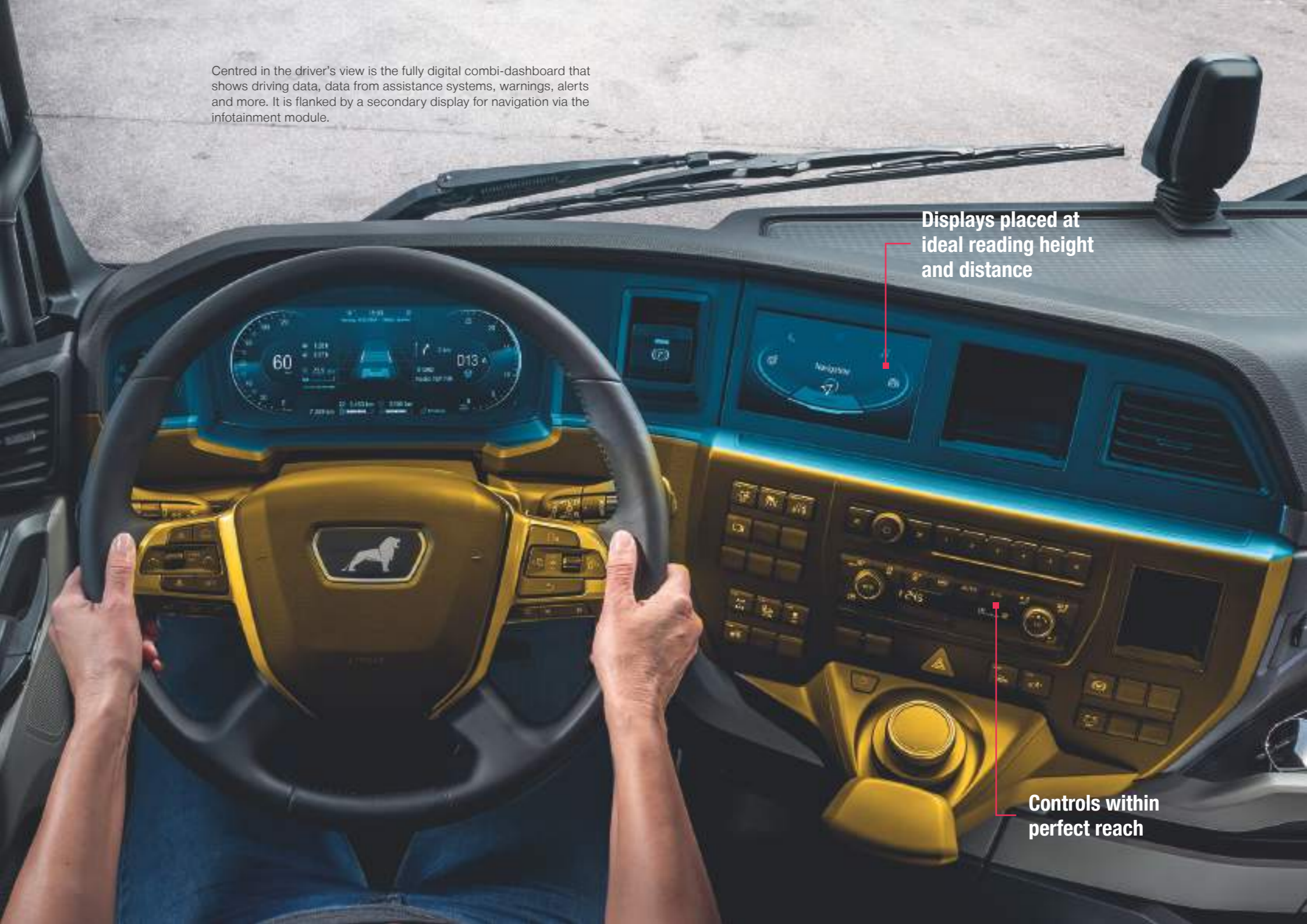
Centred in the driver's view is the fully digital combi-dashboard that shows driving data, data from assistance systems, warnings, alerts and more. It is flanked by a secondary display for navigation via the infotainment module.