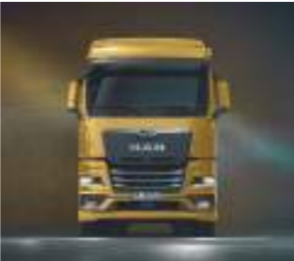
CAB GX: THE MAXIMUM ONE (wide, long, extra height)