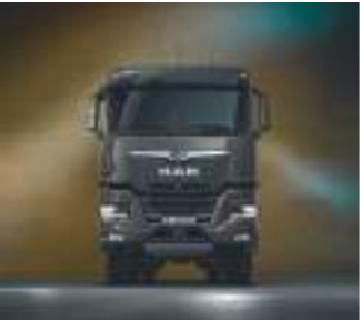
CAB GN: THE ROOMY ONE (wide, long, standard height)