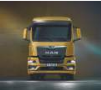
CAB TM: THE COMFY ONE (narrow, long, medium high)