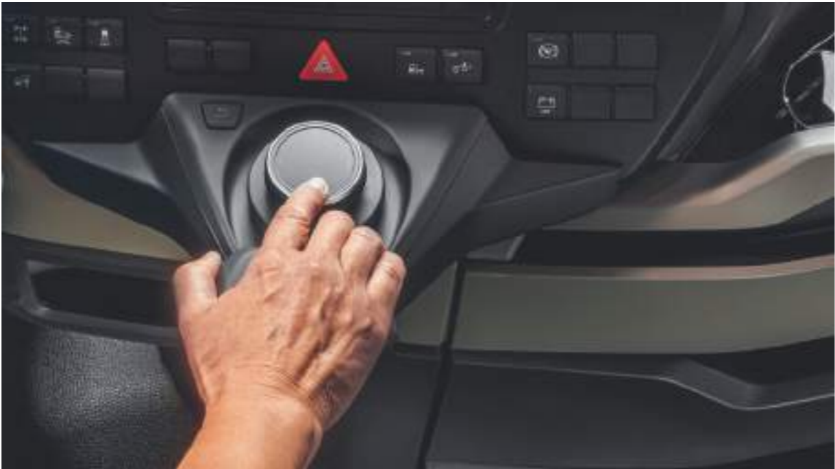
Innovative MAN SmartSelect multimedia controls

One feature is even an absolute first: the trailblazing MAN SmartSelect system, which was developed together with our customers, makes using the multimedia system child's play even in demanding driving situations. Here, too, comfort was our inspiration for eliminating the touchscreen. Functions such as map, music, cameras and more can now be operated via MAN SmartSelect with comfortable hand rest. There's so much more to discover in our new driver's cabs, so get in, get comfortable and enjoy all the new possibilities.