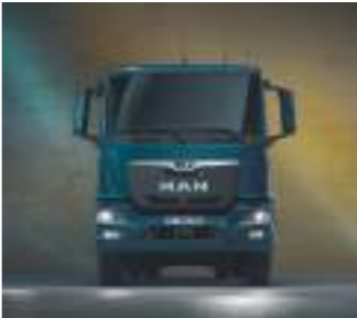
CAB TN: THE FLEXIBLE ONE (narrow, long, standard height)