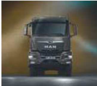
CAB NN: THE PRACTICAL ONE (narrow, medium length, standard height)