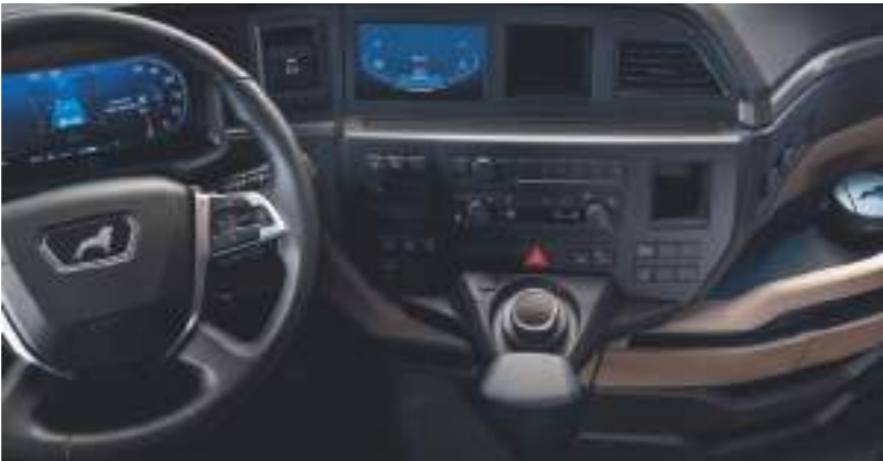
Infotainment system with 7" display and MAN SmartSelect