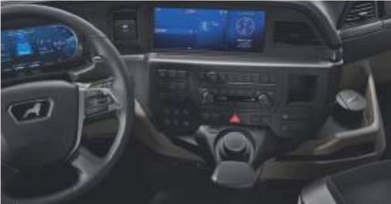
Infotainment system with 12" display and MAN SmartSelect