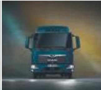
CAB CC: THE COMPACT ONE (narrow, short, standard height)