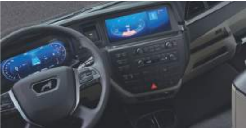
Infotainment system with 12" display and selection switch