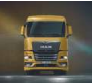
CAB GM: THE GENEROUS ONE (wide, long, medium height)