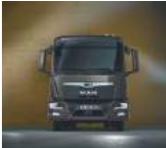
CAB DN: THE CREW CAB