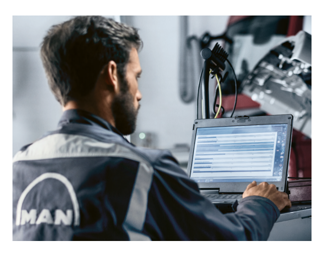
MAN Roadside Assistance provides round-the-clock assistance, seven days a week.

In the unlikely event of a breakdown, just call the MAN Roadside Assistance call centre on 1800 676 711 and a skilled agent will then set the ball rolling so you get help as fast as possible.