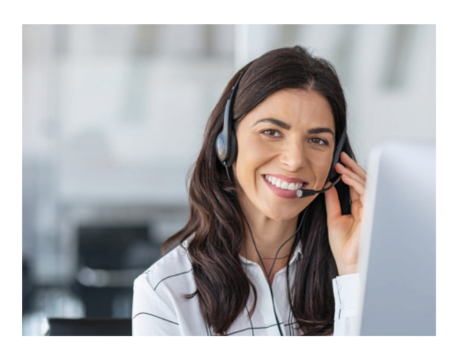
With MAN service contracts you're guaranteed peace of mind.

Benefit from an extended warranty for either the entire vehicle or drive-line up to 5 years and 1,000,000 km (select models apply). You can also combine an extended warranty package with a flat rate service contract (refer Comfort Plus package). A service package that's worth its weight in gold.